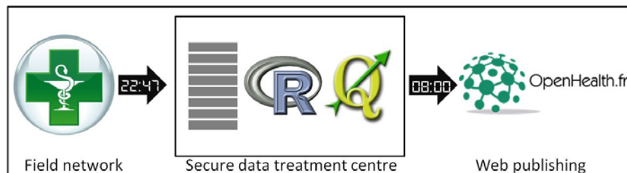
From the field to the web : the daily data processing scheme